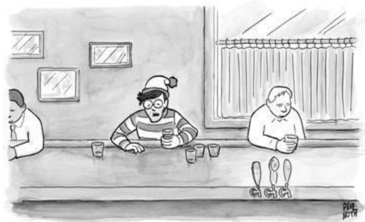
"Nobody ever asks 'How's Waldo ?'"